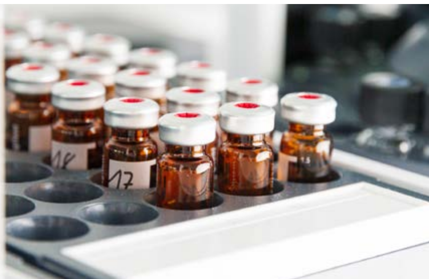
Samples for the quantification of aromatic compounds in lignin oils

Reliable in-process analytics are essential for rapid evaluation and the associated successful establishment of new processes and the scaling of advanced procedures. A particular challenge here is the complex sample matrix of fermentation broths, lignocellulose or chemical reactor waters. Various are therefore available for analytical characterization, some of them online.