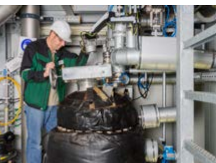
top: A hemicellulose sample after lignin precipitation