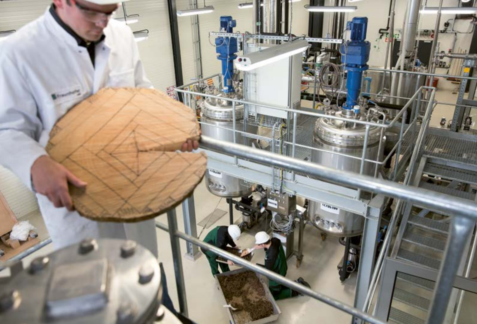
Pilot plant lignocellulose biorefinery

Fraunhofer CBP is a unique, modular platform for representing complete process chains – from processing raw materials followed by various conversion processes to product separation and purification. With this flexible concept raw materials such as plant oils, cellulose, lignocellulose, starch, sugar or CO 2 can be processed and converted into chemical products. The construction of Fraunhofer CBP was made possible by start-up financing provided by the Land of Saxony-Anhalt, project funding via the German Federal Ministry of Education and Research (BMBF), the German Federal Ministry of Food and Agriculture (BMEL) as well as the Fraunhofer-Gesellschaft.