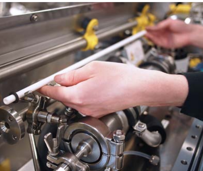
Ceramic membrane of the cross-flow membrane filtration plant