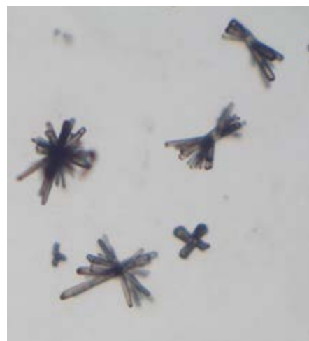
Crystals of ferulic acid produced by fermentation