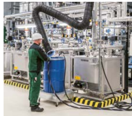
top: Countercurrent extraction plant