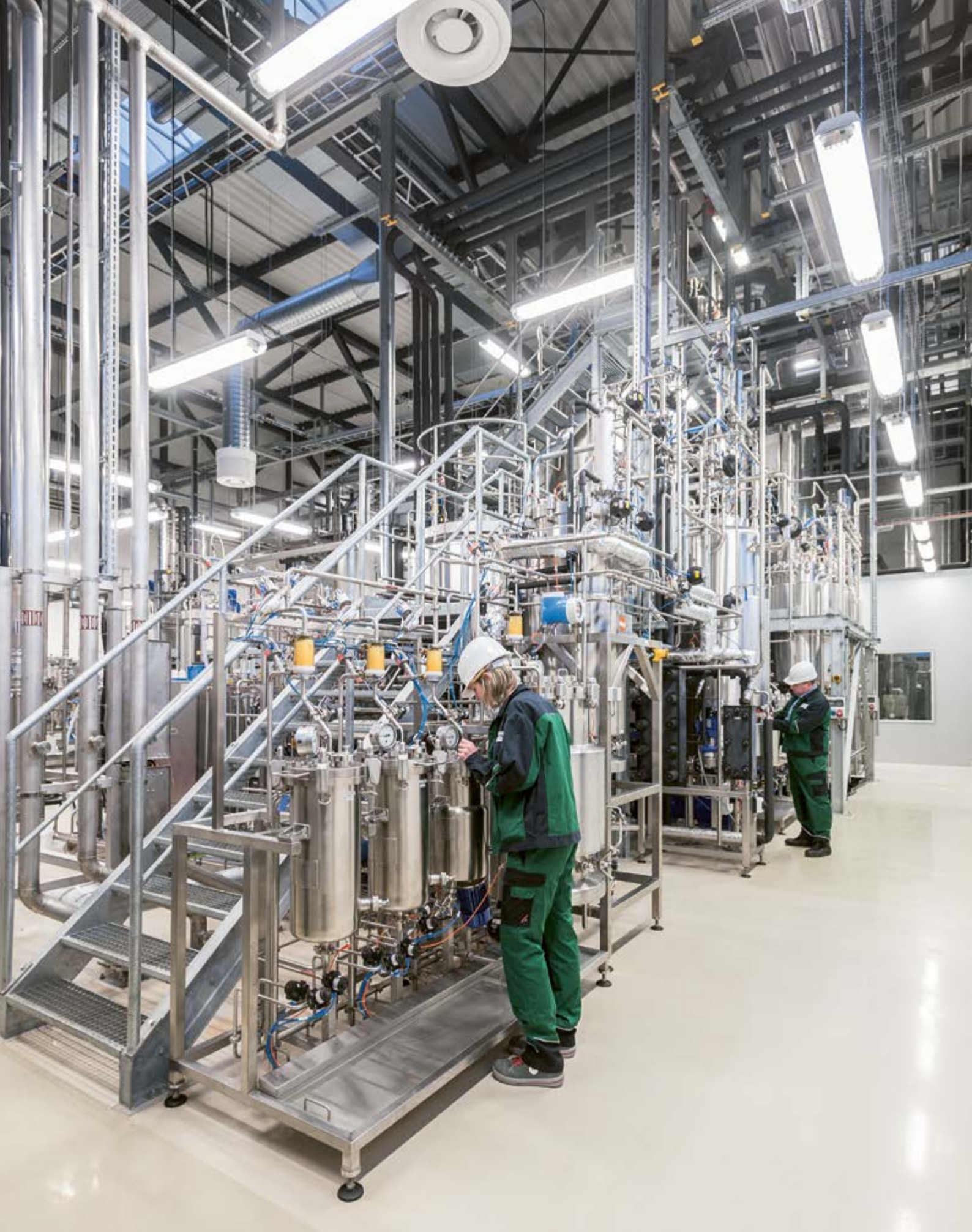
Fermentation plant for the cultivation of various microorganisms (cascade from 10 to 10,000 liters)