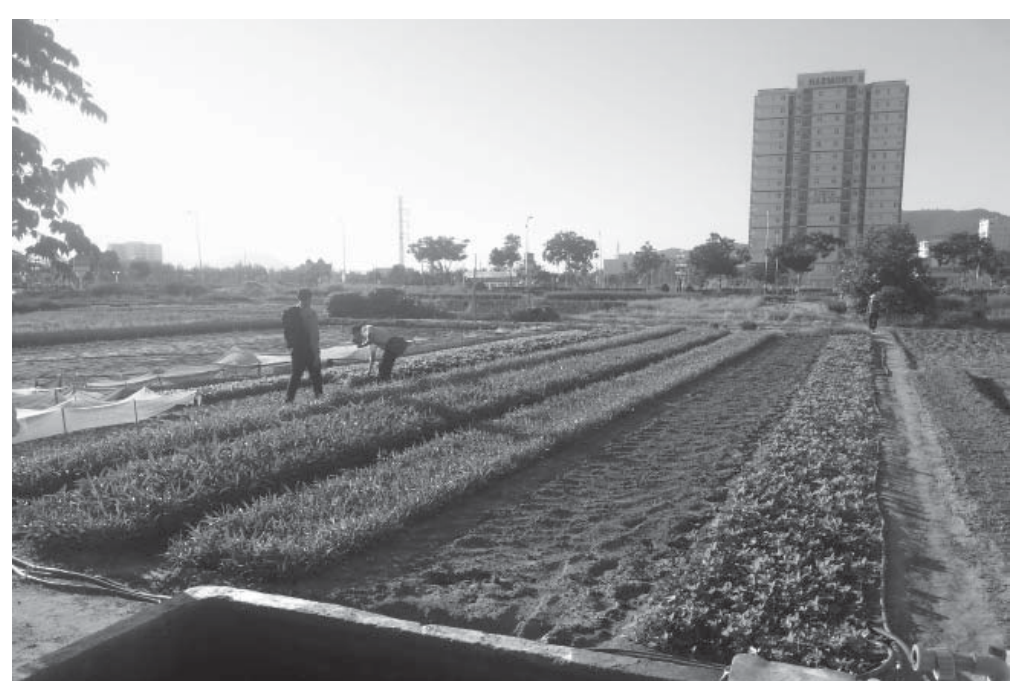
Agricultural areas in the Vietnamese city of Da Nang: in the future, residents can use purified wastewater to water their crops. (© Fraunhofer IGB) | Picture in color and printing quality: www. fraunhofer.de/press

The system could be implemented in many different regions, in particular where there is no sewer system or sewage treatment. "It's also suitable for export to areas with little water because it can be adapted to fit the needs of arid and semi-arid regions," Mohr adds.