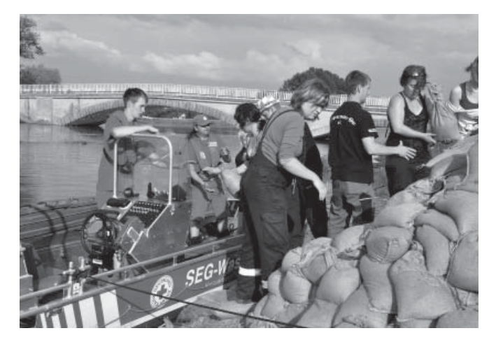
During the flooding crisis in eastern Germany in June 2013, volunteers and professional aid workers toiled side by side. (© Deutsches Rotes Kreuz, LV Brandenburg) | Picture in color and printing quality: www. fraunhofer.de/press

For more information on INKA, please visit www.inka-sicherheitsforschung.de