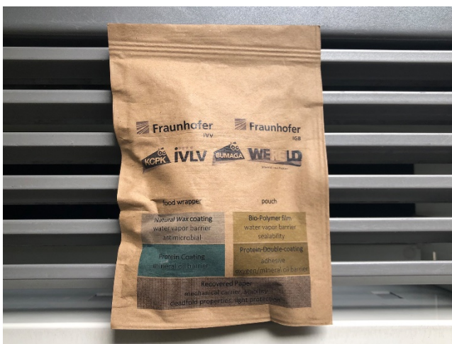
Fig. 1: A resealable bag made of paper with the coating on the inside. After use, the packaging is placed in the waste paper recycling bin with the bioactive materials.