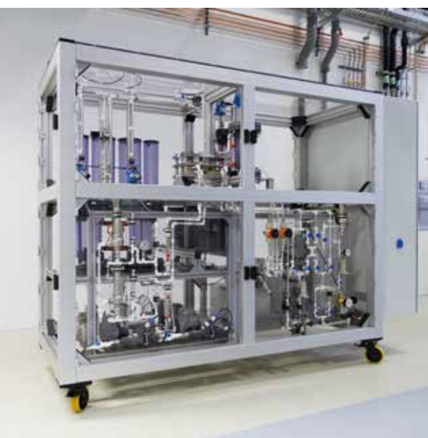
Automated, mobile demonstrator unit