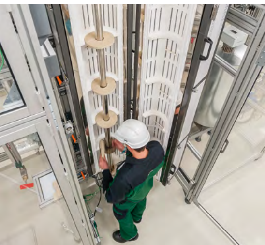
Flow tube reactor embedded in a hinged tube furnace

After the reaction, the cleavage product solution is cooled down to ambient temperature and the pressure is decreased. Then the gaseous reaction products are separated and collected.