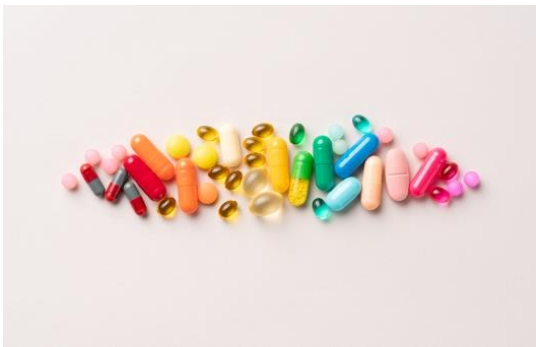
Image 1: Fine chemicals are used in pharmaceutical production in particular. Large quantities are less of a concern in these applications than functionality and high purity levels.