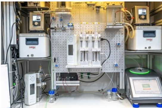
Image 2: The joint projects developed a new technology platform for production of fine chemicals.