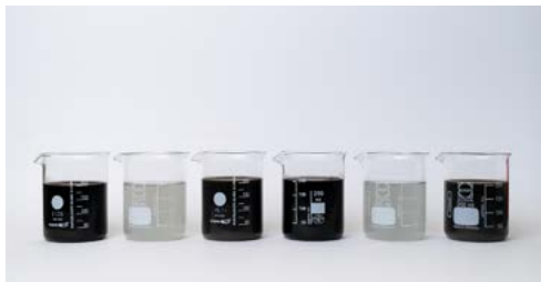
Effective treatment of complex wastewaters. Decolorization of olive mill wastewater achieved by LaChiPur

Our LaChiPur flocculant is made from chitosan, obtained from residues of the food industry (fungi and crabs) and, furthermore, equipped with the enzyme laccase. Thus, in addition to its flocculation properties, LaChiPur can also oxidize organic pollutants e.g. phenolic compounds, reducing toxicity to microorganisms in the aeration tank and ultimately reducing energy use. Furthermore, LaChiPur has shown precipitation properties making it a potential biobased precipitation agent to remove phosphorous, for example.