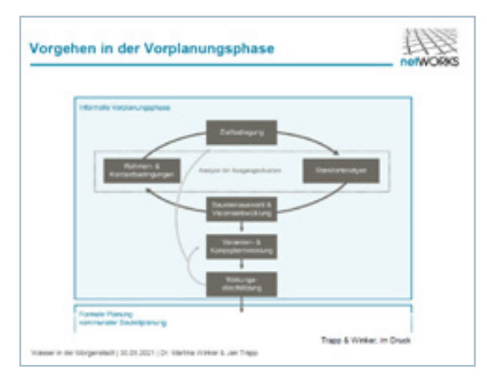
Steps in the preliminary planning phase.

In the subsequent discussion, the difficulties in integrating technical issues are addressed. The central challenge is to address all urban stakeholder groups in a way that is appropriate for the target group and includes the respective perspective. With regard to the availability of resources for planning projects, the discussion points out that large cities are often already well positioned, but smaller municipalities face capacity-related challenges in organizing processes. Often, a large amount of information exists, but specific implementation on site does not take place due to staff capacity bottlenecks. Here, blueprints, templates and a mutual transfer of knowledge could support the municipalities.